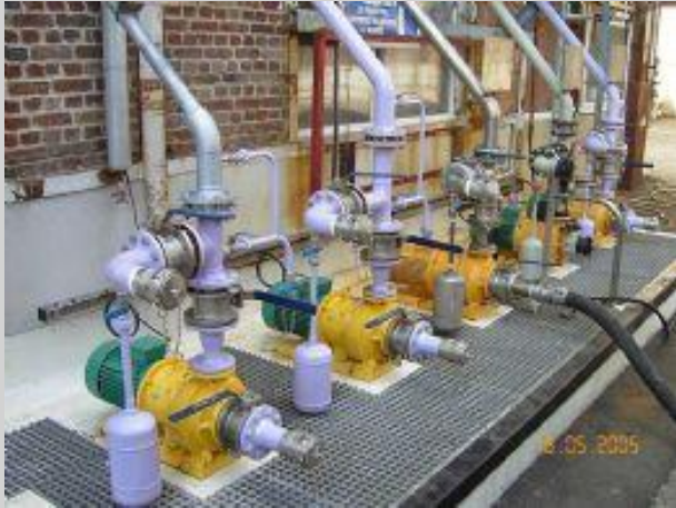
TANKER OFFLOADING PUMPS