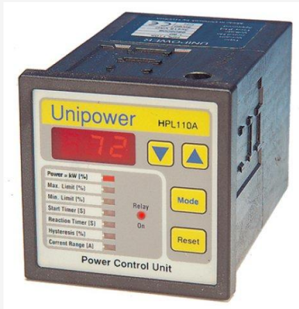
HPL110A POWER CONTROL MONITOR

POWER CONTROL MONITOR FOR PUMP DRY RUN PROTECTION